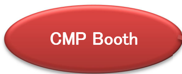
Map of entire exhibition hall

We are looking forward to seeing you at our booth.